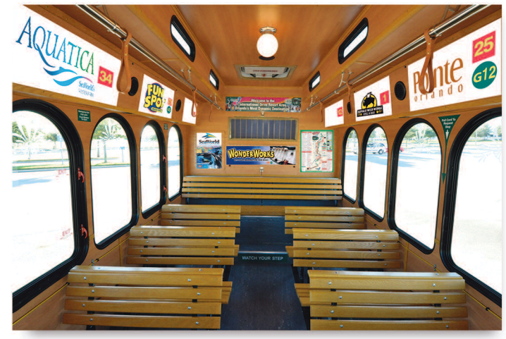
*Advertising Rates are monthly.

Interior Back Wall: $245/sign* Production: $115/sign